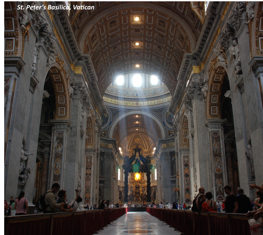
St. Peter's Basilica, Vatican